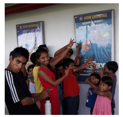
PVR Nest treated all our kids to a Bollywood movie Dhanak and snacks