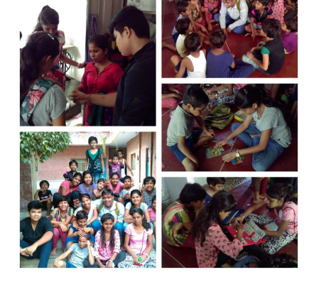
NGO Adhyayan's visit to KM