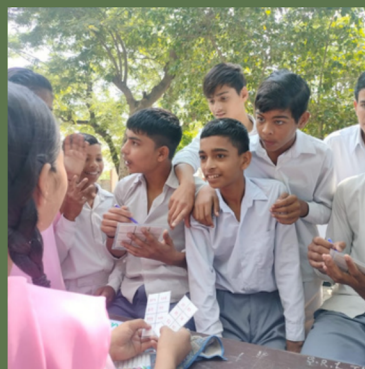
4 operation game