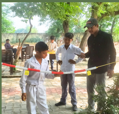
Learning counting's through 100 Mala Game