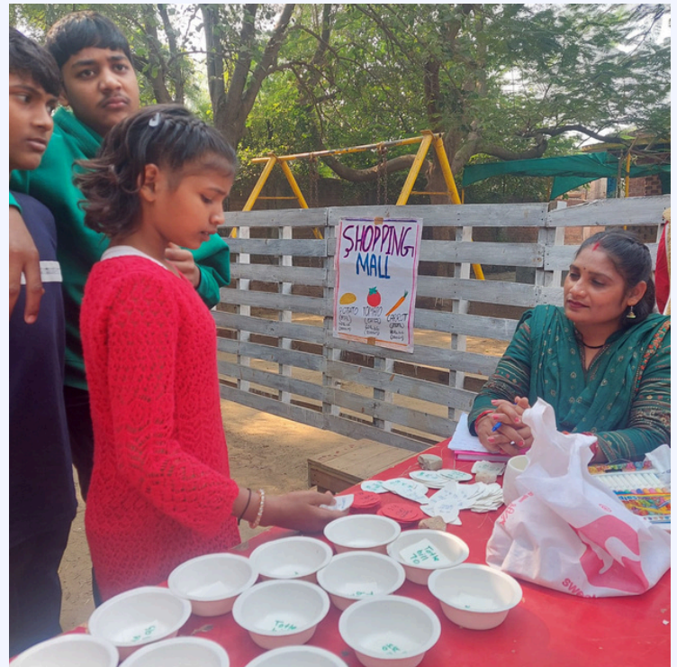
Learning Maths through shopping