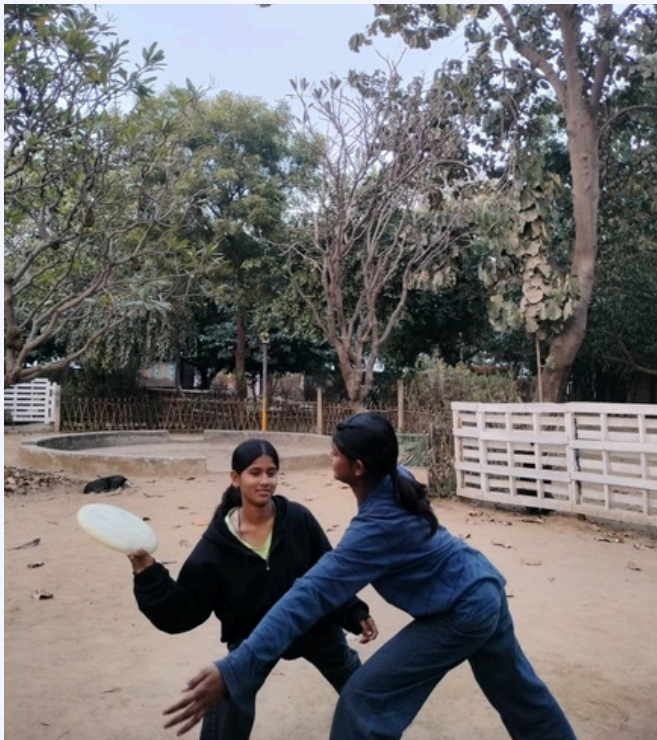
Girls Empowerment Through Frisbee Sports