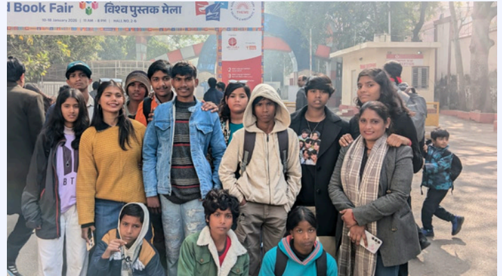
Children at the International Book Fair