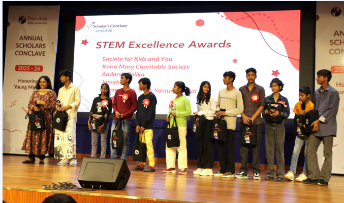
STEM Kit by Protsahan NGO