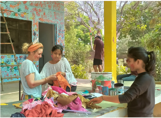
WINGS IN MAKING

Studio Roof from Amsterdam sent a three member team to volunteer for an art workshop. They painted a wall with the children drawing a pair of wings with recycle cloth as a symbol of freedom.