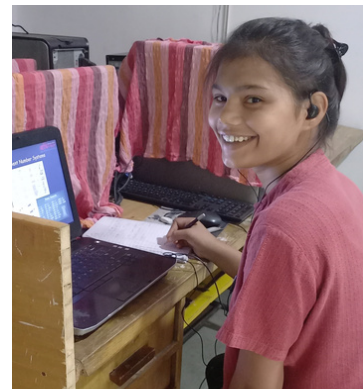
Core group Math workshop by Aavishkaar