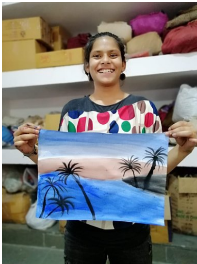
Painting Workshop by Artreach India