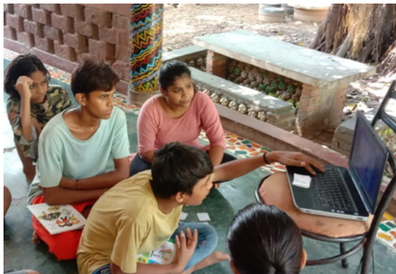
Primary Math workshop by Aavishkaar